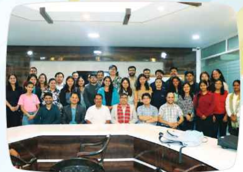
Talk Program in Monetary Policy