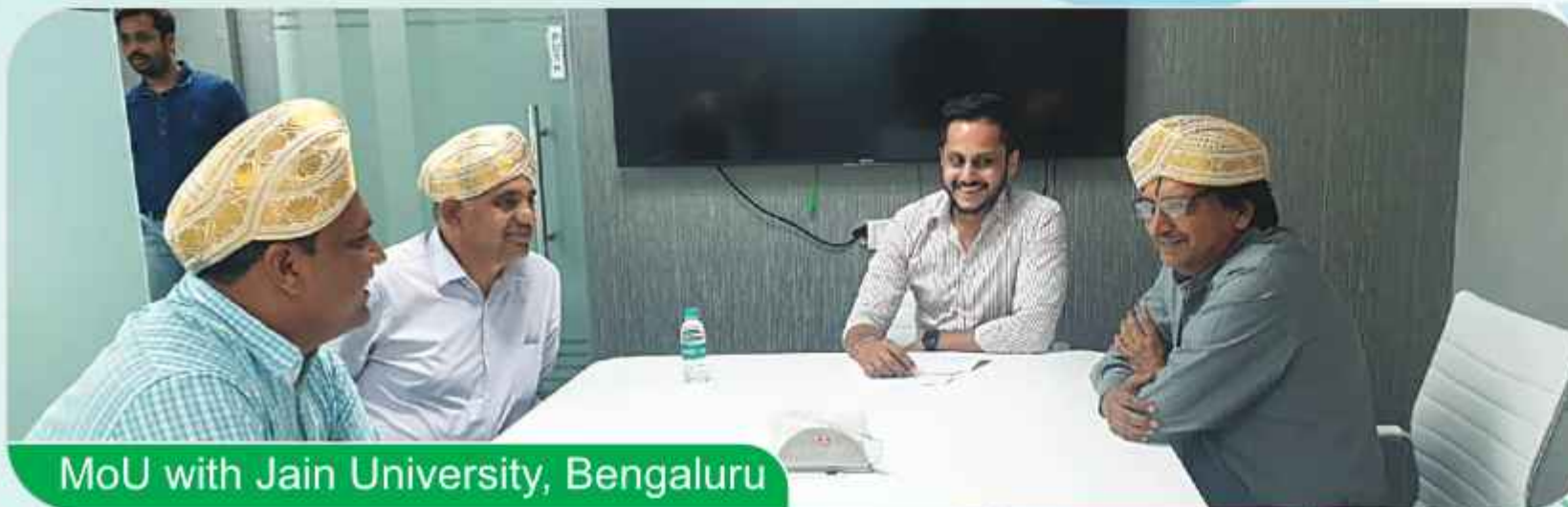
MoU with Jain University, Bengaluru