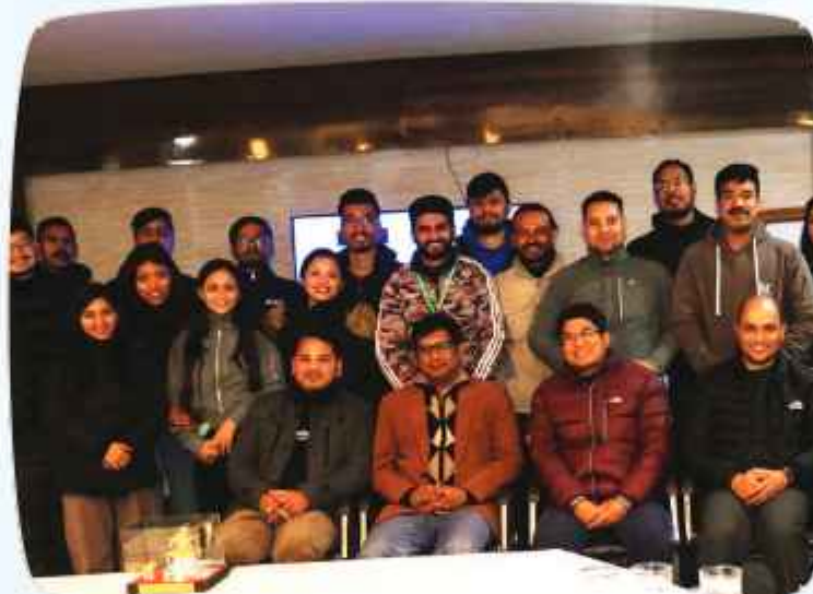
DAVians Interaction with Vice Chancellor of Purbanchal University