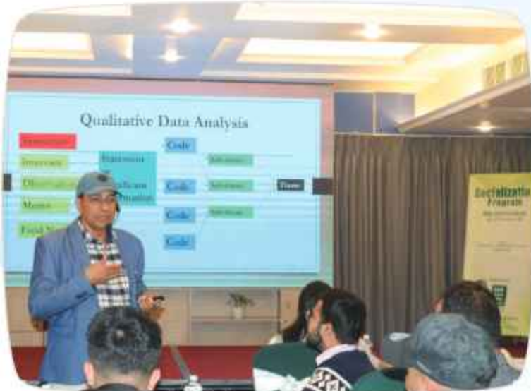
Workshop on Qualitative Data Analysis