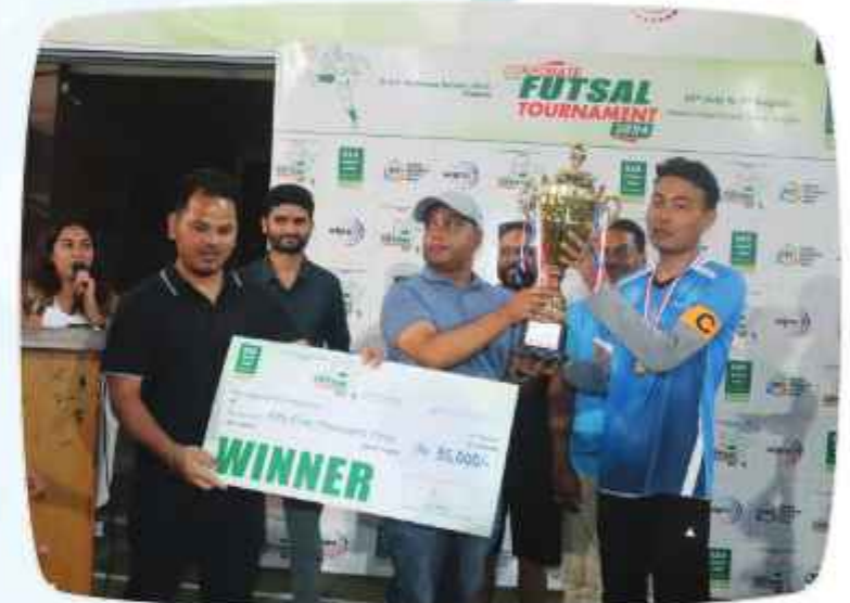
Corporate Futsal Tournament