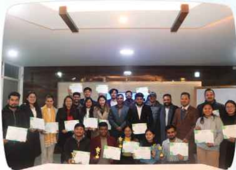
Survey Presentation & Awards