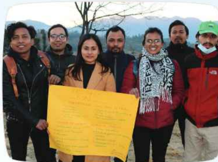
Onfield Presentation of Survey Research