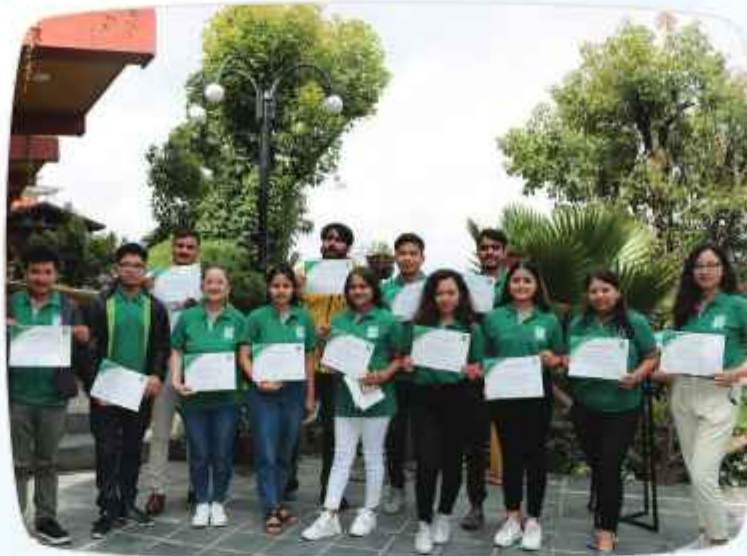
MBA Symposium on "Build Your Resilience & Adaptability"