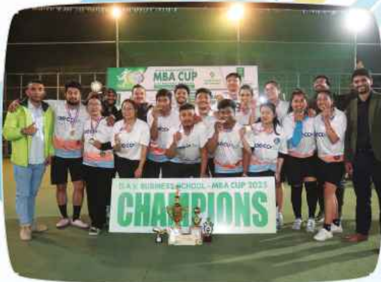
MBA Cup Futsal Tournament 2025