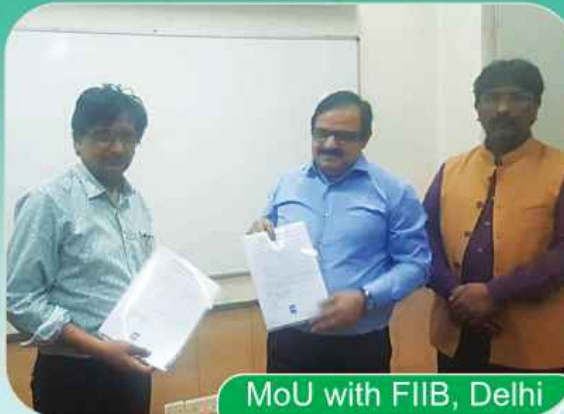
MoU with FIIB, Delhi