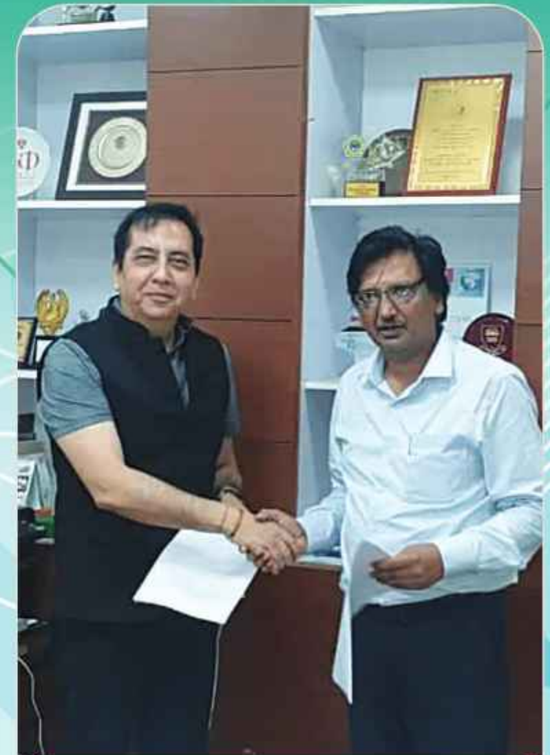
MoU with Sharda University, Delhi