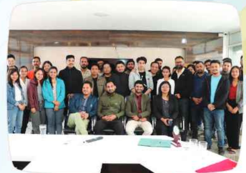
Workshop on "Stock Market"