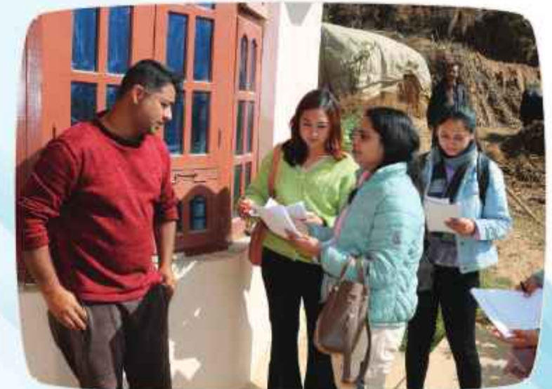
Survey Research at Lele