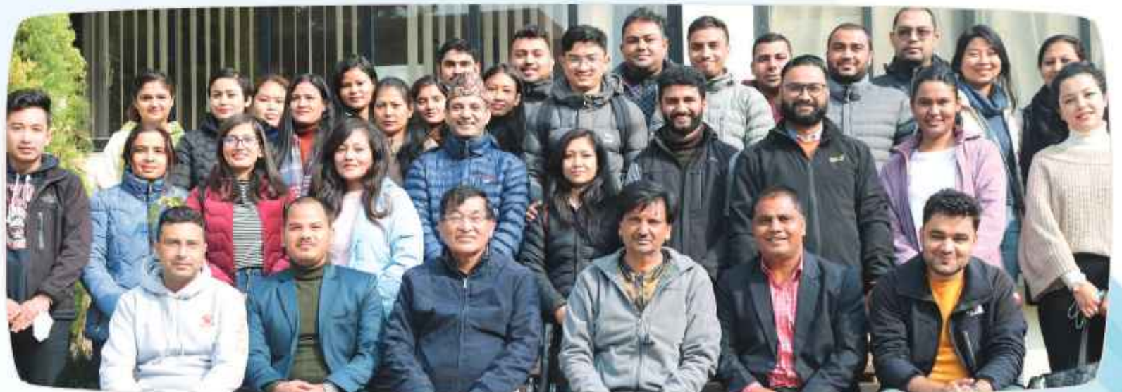
Workshop on "Research Methodology"