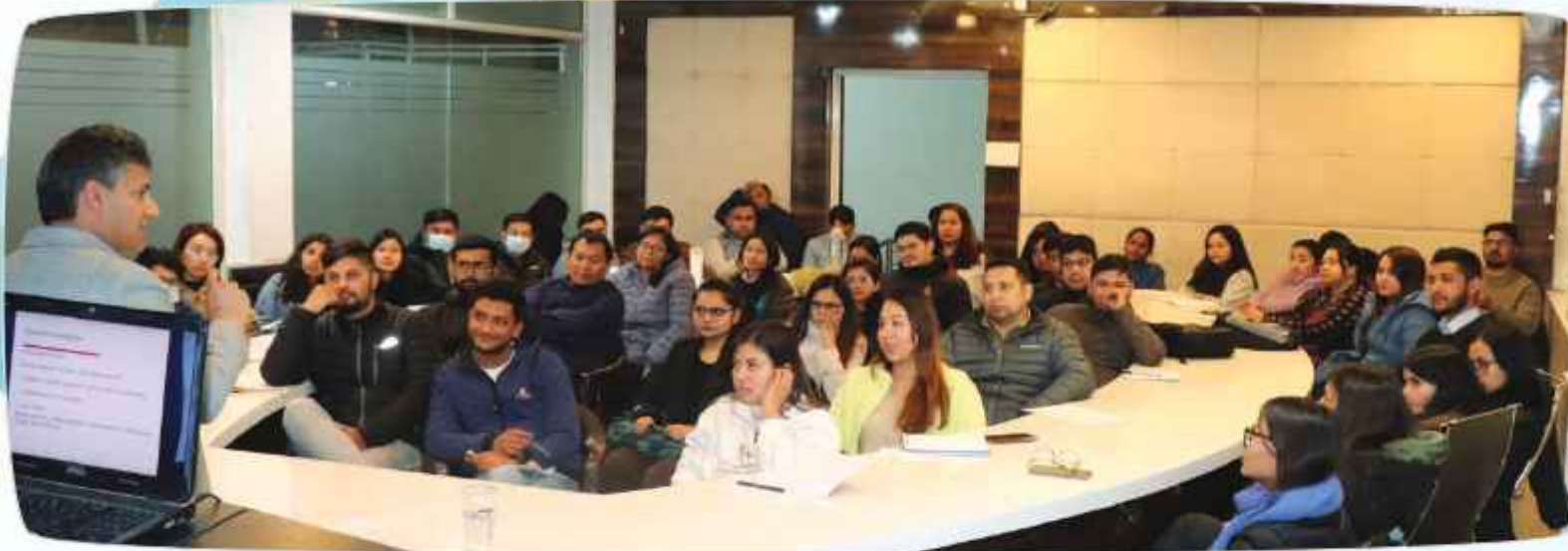
Guest Session on Contemporary HR Practices