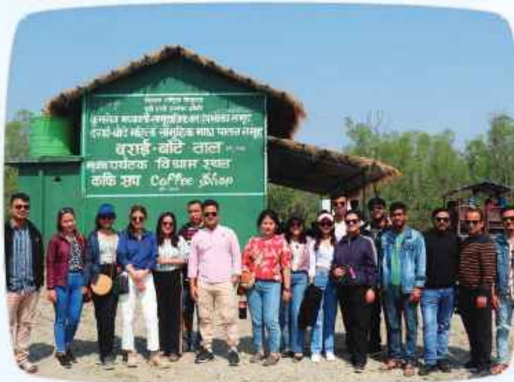
MBA Tour to Chitwan