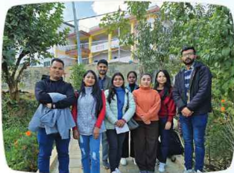
DAVians Project Work Visit to Shree Aurobindo Yog Mandir