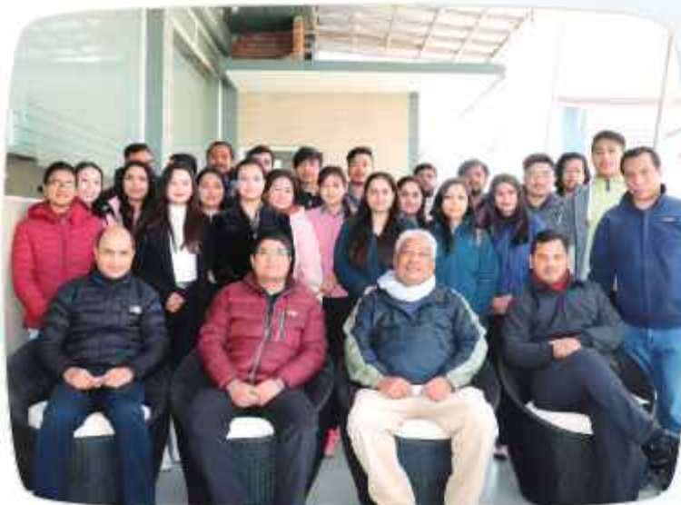
Guest Session on "Social Entrepreneurship"